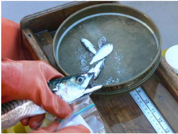
Figure 2. Fresh YOY alewives in the diet of a mackerel caught off the mouth of the Damariscotta River. October 2007.