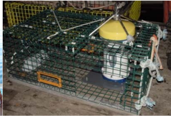
Figure 4 – the Aquadopp acoustic Doppler current profilers from NMFS (l) and GoMOOS (r)

The ADCP was secured in a customized lobster-style trap which replaced one trap in the trawl for three deployments (Figure 4). The PI retrieved the data from each deployment and submitted it to the Lead Scientist for processing.