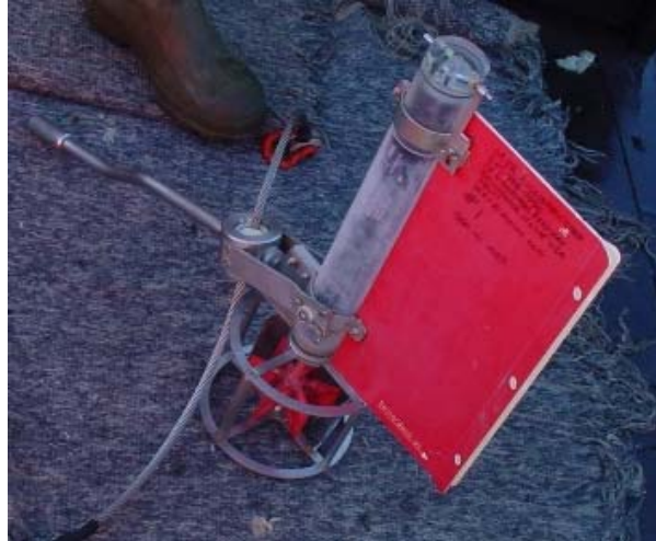
Figure 3 – Sensor Data 6000 flow meter being rigged on the boat's deck

During the two-week period, the trawl was hauled once or twice (in its normal harvesting rotation, but with extra care) by Look, and observations about the current meter and pressure sensors were noted in a logbook. The logbook was comprised of a diagram of the trawl showing the position and ID number of the pressure sensors; and a logsheet where deployment and hauling dates and locations were notated. (See attached "Look Logbook".)