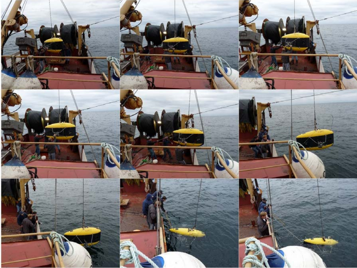
Figure 1: Photographic sequence of a routine deployment of the Odyssey IV from the F/V Isabella & Ava using the overhead boom crane. Field operations were conducted at Stellwagen Bank in October 2009.